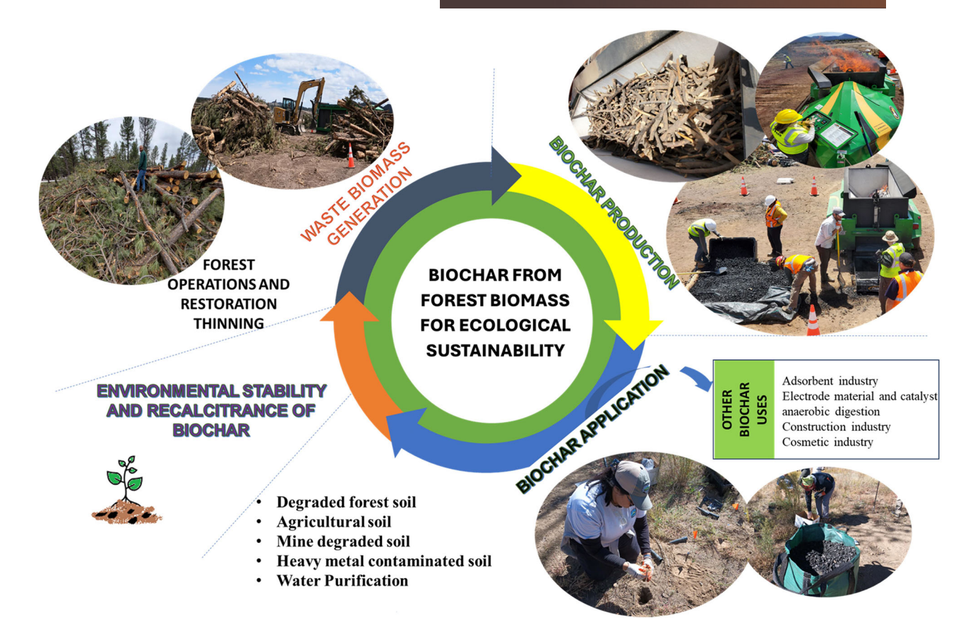
FIGURE 3 Biochar produced from forest waste biomass as a resource for sustainability.

in soil for long periods. This helps mitigate GHG emissions and contributes to climate change mitigation efforts and contributing to a closed carbon cycle.