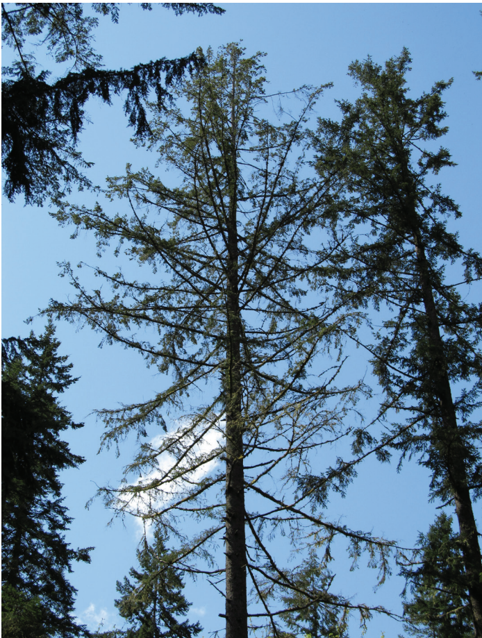
Figure 3. Uniformly fading crown and shortened leader growth.