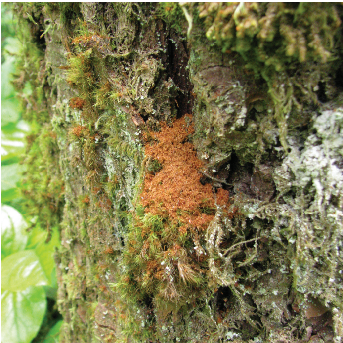
Figure 5. Piles of wood dust in bark crevices.