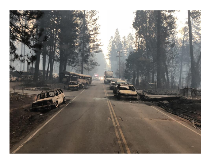
Fig. 3. Photograph of abandoned and burned vehicles located on Skyway within the extent of burnover ID no. 4, seen at 1049 hours on 9 November. This section of roadway is 7 m (23 ft) wide with variable fuel setbacks ranging from 0 to 10 m (33 ft).

the burnover severity and impacting egress routes in many of the identified burnover events. Road widths ranged from 3 m (10 ft) on narrow tertiary local roads to 23 m (75 ft) wide multi-lane primary arteries.