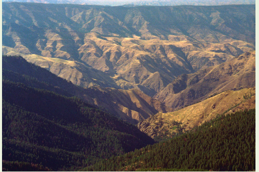
Topographic features.

Topographic features such as saddles or passes between two ridges can change wind patterns, funnel air, and increase wind speed, which can intensify fire behavior. Some features such as ridges, rock outcrops, streams, rivers, lakes, or roads can act as fire barriers and can be used to create a boundary around fires for firefighting or fuelbreaks for future fires.